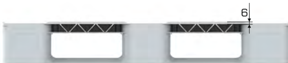
Safety Rims Option