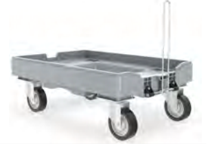
With Wheels+With Towbar